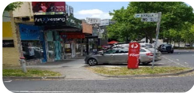
Assembly Area 2 - Corner of Maroondah Hwy & Bardia St

Wardens: The Nominated Warden will be the Director of the meeting .