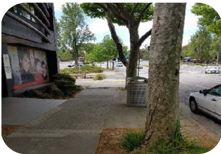
Assembly Area 1 - Corner of Maroondah Hwy & Larissa Ave